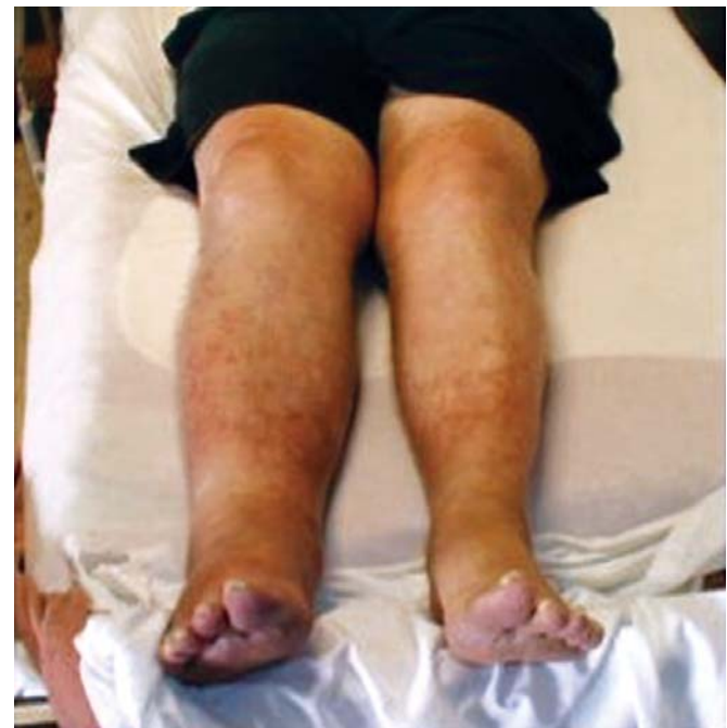
Fig. 2: Patient of deep vein thrombosis

A variety of risk factors predispose to DVT like previous h/o venous insufficiency, old age, obesity, malignancy, immobilization, hypercoagulable state, varicose veins, surgery more than 2 hours. Hence judicious selection of cases and pre-