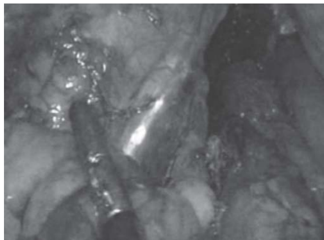
Fig. 3: Intracorporeal view of illuminated ureteric stent