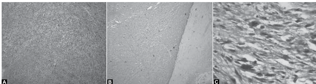
Figs 2A to C: (A) H&E staining, (B) bizarre spindle cells and (C) h-Caldesmon