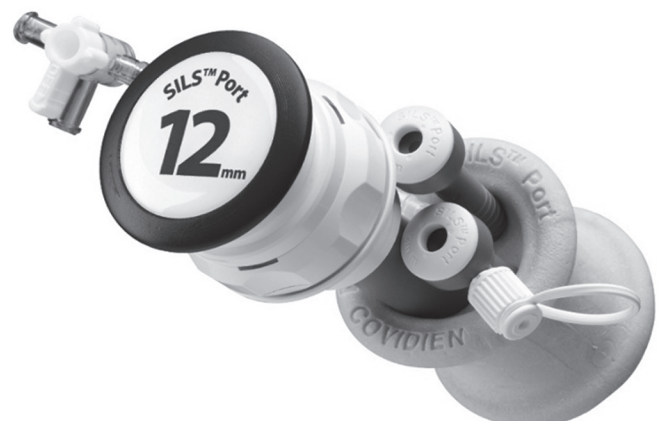
Fig. 1: Single-incision laparoscopic cholecystectomy™ port

A 2-cm incision is needed to access the abdominal cavity. SILS™ port (Fig. 1) is introduced and carbon dioxide is insufflated into the abdomen to a pressure of 15 mm Hg. Optical port of 10 mm is introduced into the