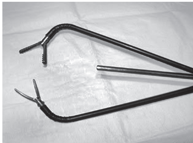
Fig. 3: Roticulating instruments