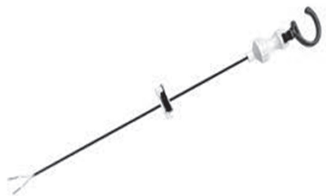
Fig. 4: Stryker mini alligator

central cannula and diagnostic laparoscopy is done (Fig. 2). Roticulating instruments (Fig. 3) are introduced into two 5 mm cannula. Fundus of the gallbladder is retracted using Stryker mini-alligator introduced separately (Fig. 4). The procedure is carried out in the same way as conventional laparoscopic cholecystectomy (CLC).