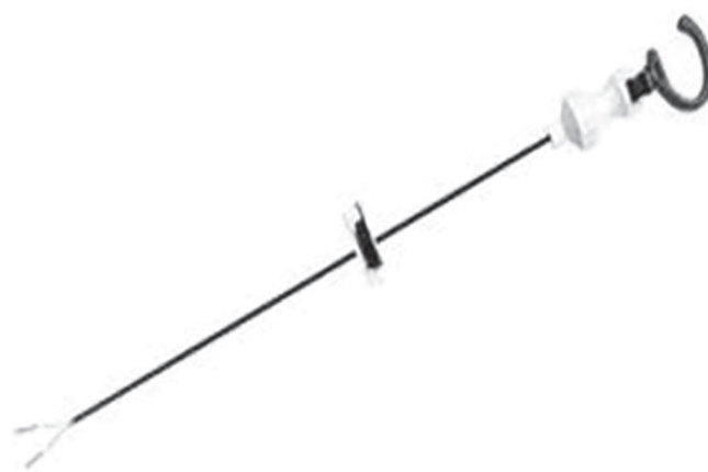
Fig. 2: Mini alligator for two-port LC