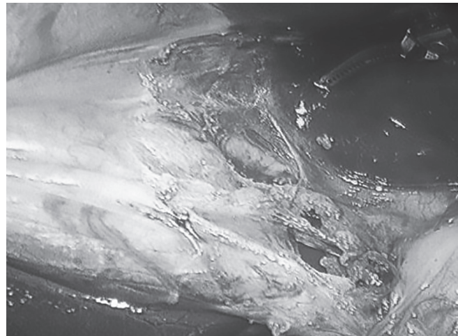
Fig. 2: Critical view of safety

with a brief description and picture without a thorough explanation of the rationale for this approach.