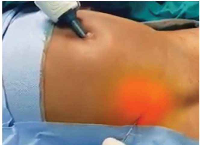
Fig. 1: Umbilical port placement

From March 1, 2010 to March 1, 2023, 50 patients with IH underwent laparoscopic herniotomy (LH) at our facility (46 men and 4 females). Parents were told about the many sorts of surgeries available and were offered laparoscopic surgery for their kid if they so wished. Under general anesthesia, all laparoscopic operations were conducted with the patient supine. For all patients, a pneumoperitoneum of 6–10 mm Hg was produced using Hasson's method via the first implanted infra umbilical trocar. (Fig. 1) The peritoneal cavity was visualized using a 5-mm telescopic camera. 3 or 2-mm triangulation tools were employed to close the inner inguinal ring. The deep inguinal rings on both sides were visualized after the ports were placed, and the inguinal hernia was detected. The sac was meticulously dissected from the chord structures (Fig. 2). Using a standard open surgery needle holder, a 3-0 suture